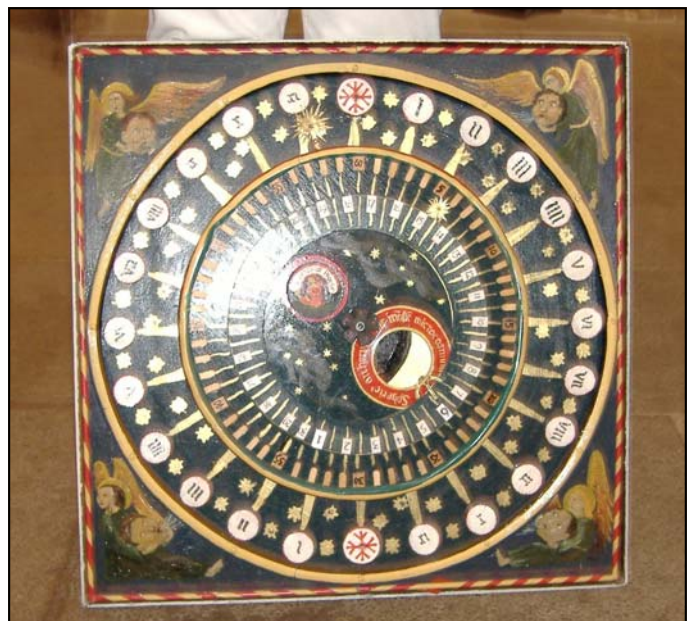
A demonstration model of the Wells Astronomical Clock

Sue Hitchings Gloucester Diocesan RE Resource Centre