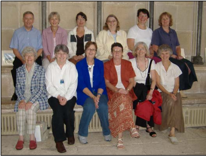
Saying cheese in the Chapter House