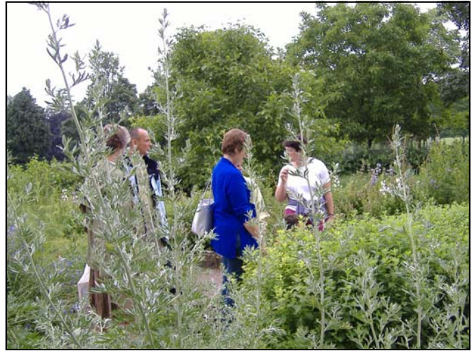
In the herb garden at Glastonbury Abbey