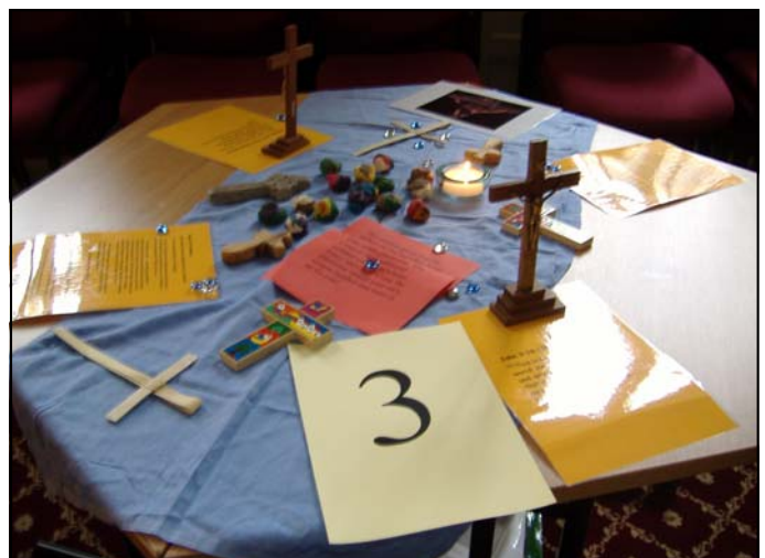
Station three of the labyrinth