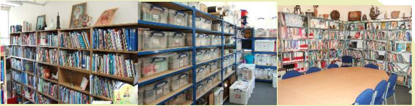
Hampshire RE Centre above