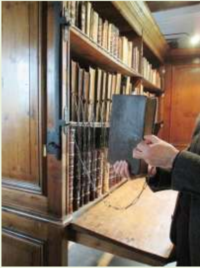
The chained library at Wells