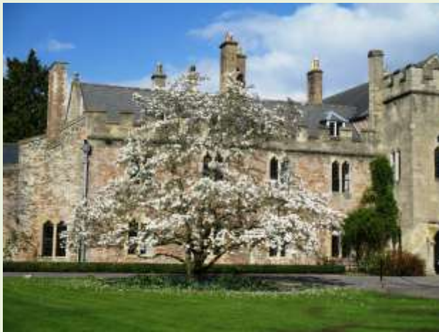
The Bishop's Palace and Garden

After an extremely nice lunch at The Bishop's Table café, we looked around The Bishop's Palace and Gardens. One highlight was watching a sculptor carving a large hand from the trunk of a tree which had fallen in the gardens. We adjourned again to The Bishop's Table and somehow managed to squeeze in a cream tea!