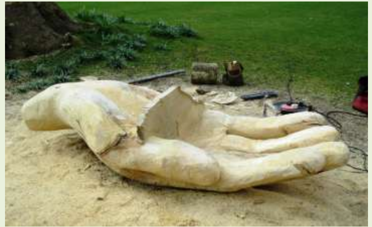
The Sculptor's art

I came away from my day in Wells feeling that it was a day very well spent, with new contacts who are facing similar issues as me and with fresh ideas to look into.