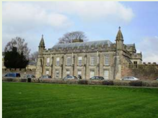
The Old Deanery

I had recently been doing a piece of work looking at how much it would cost to deliver boxes to the schools who regularly borrow from us and so it was quite illuminating to find out that other Resource Centres already have a charging policy, either included in their subscription or in addition to it. As we are located right in the city centre of Bristol where parking is possible but users have to pay to park a few minutes walk away, it may be useful for us to begin to offer a delivery service.